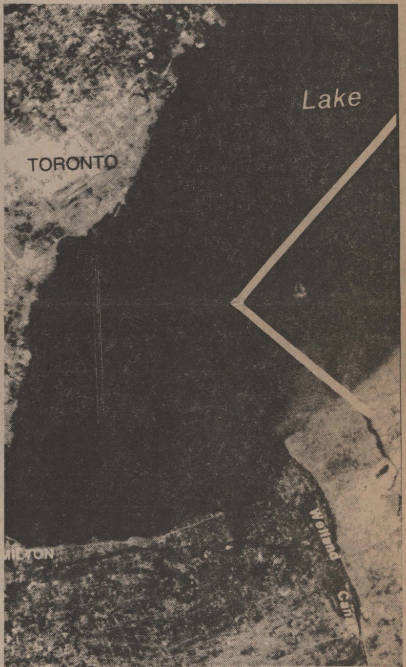
The long line jutting south in Lake Ontario from Toronto, seen in a 1975 satellite photo, has UFO researchers buzzing. Authorities believe it could have been the result of faulty satellite transmissions or a mistake by the publisher.